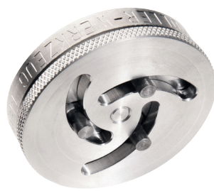
# 468 020/48 3-pin Adjustable Discs