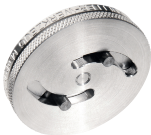
# 468 020/47 2-pin Adjustable Discs