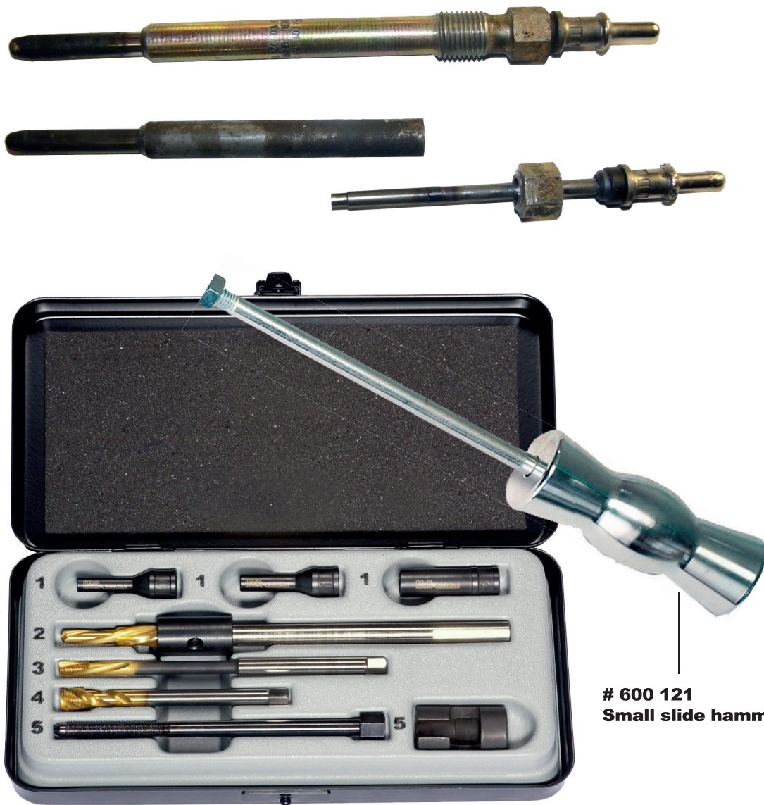
# 600 121 Small slide hammer