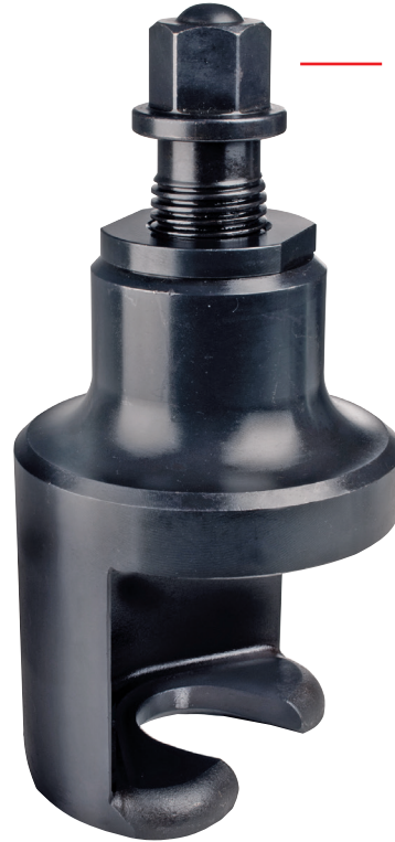
# 609 039/S Spindle complete with adapter